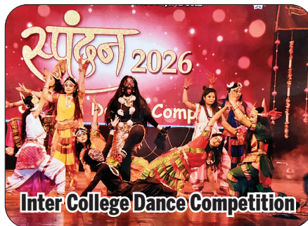
Inter College Dance Competition