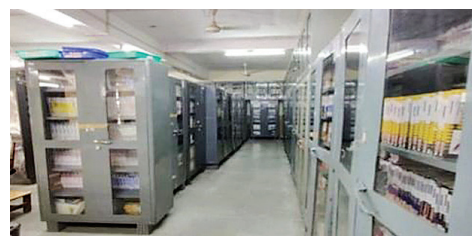
Systematic library with inflibnet facility.