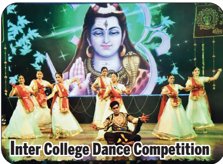
Inter College Dance Competition