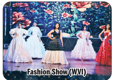
Fashion Show (WVI)