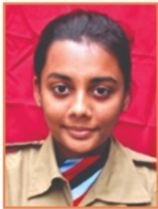
UO Shraddha Verma All India Shooting Championship Camp West Bengal 2019-20